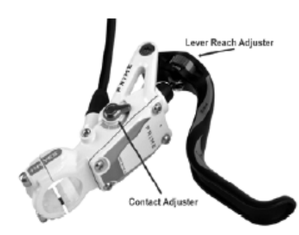
Figure 4. Contact (dead stroke) and lever reach adjustment.