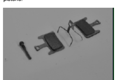
Figure 9. Brake pads, sandwich spring and pad retaining pin