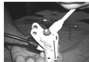
Install new piston and return spring. Lubricate piston and o-ring.