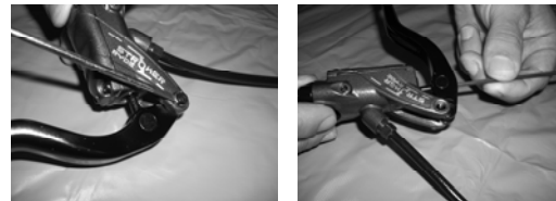
Stroker Ryde Lever Removal