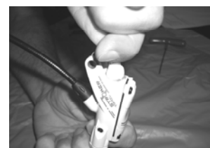
Depress piston and apply special lube to walls of master cylinder bore