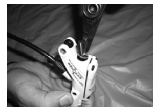
Remove the snap ring